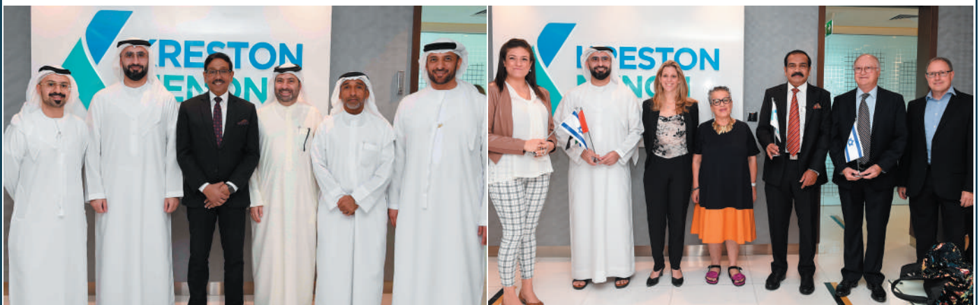
The "UAE-Israel Business Meet 2021 - A Hybrid Event" hosted by Kreston Menon and Israel's Directors Union (IDU).